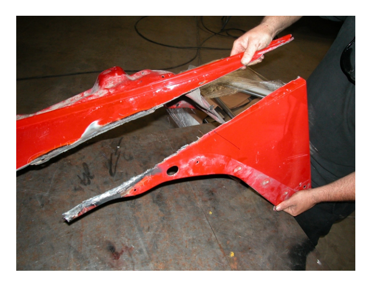
3.Remove the entire lower rear section as shown. Cut vertically down the inner side of the wheel well and remove all of the outside face of the fender.